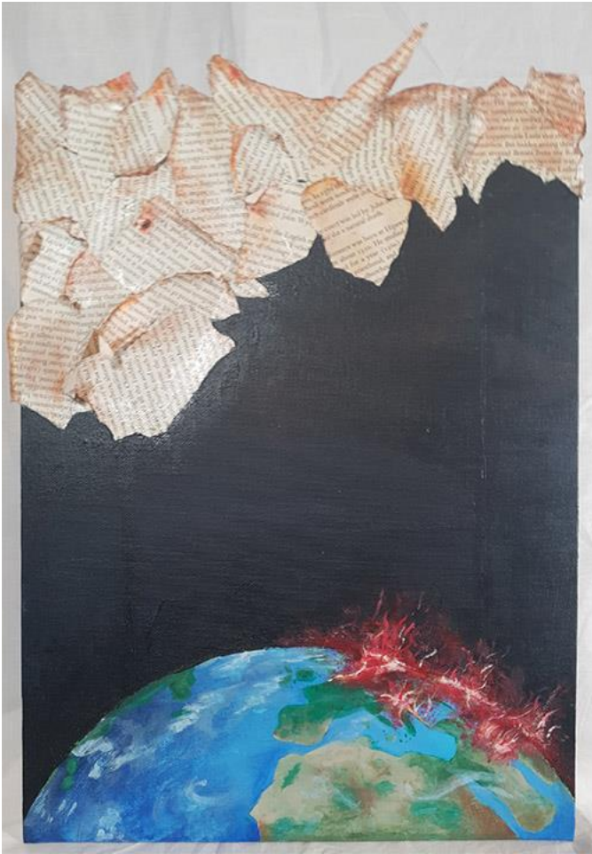
Image 10: Burning Earth (This piece is in progress both pictures will be combined when finished)