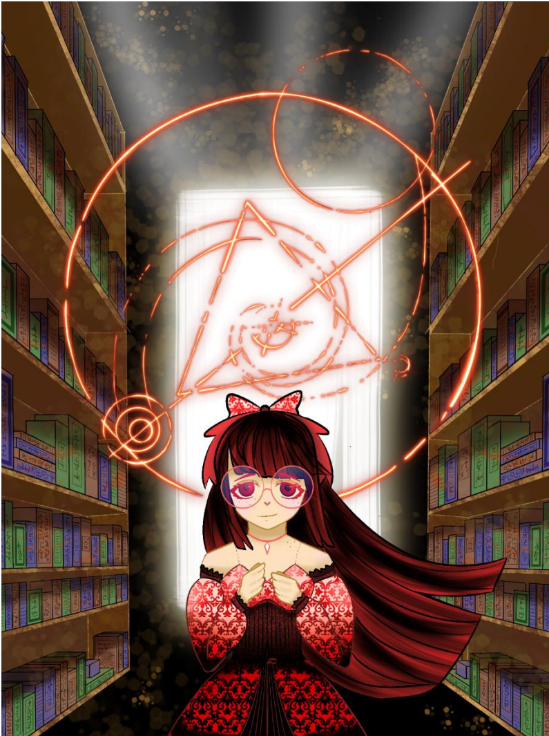
Kyrith – Video of creation

https://drive.google.com/file/d/1labdc9dNTJX0tLaQyJ0kK97JeLbwF--k/view?usp=sharing