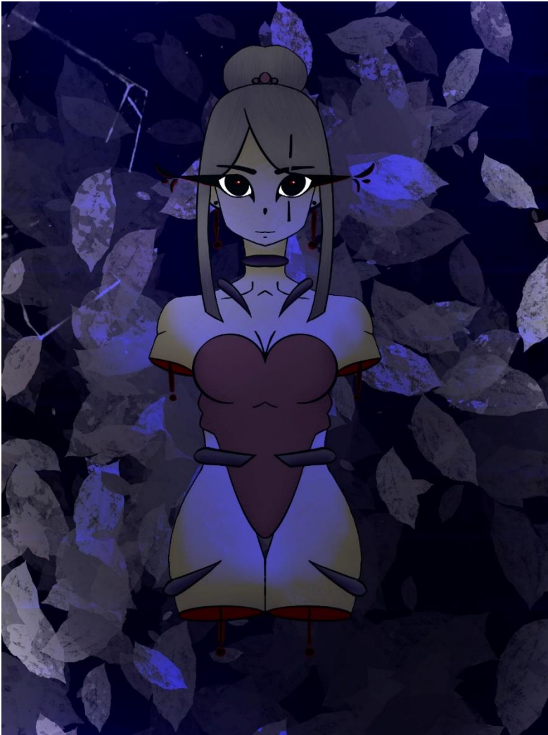
Android Girl – Video of creation from original sketch

https://drive.google.com/file/d/1KnbrhGXtoyLJrDylaOCheOVJ0MR7ZiNc/view?usp=sharing